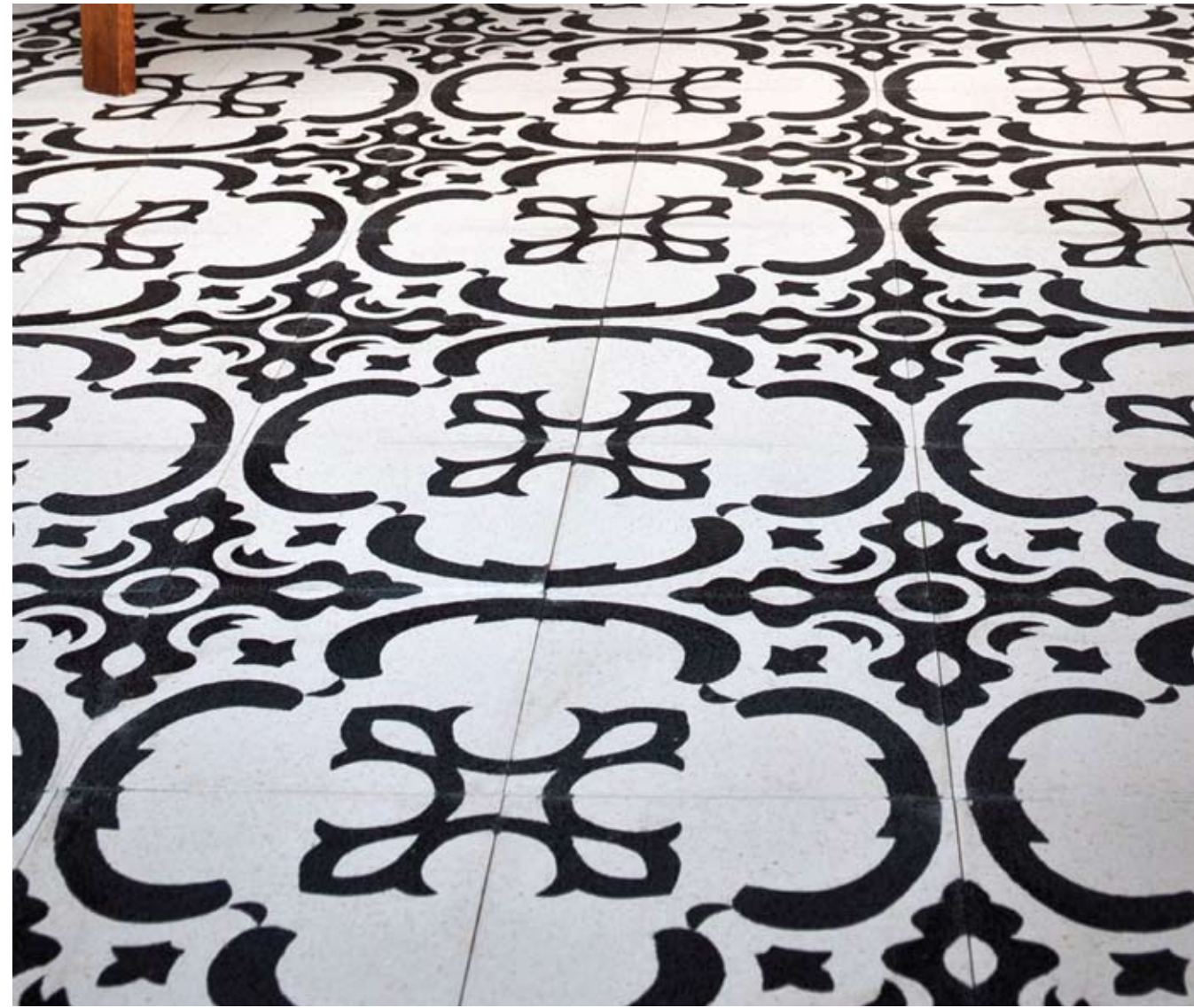
Tile patterns reflect early 20th century design

The modesty of the 1900s was not in its flooring. Eco-Terr RETRO from Coverings Etc offers highly pronounced decorative geometric patterns that have their roots in the Art Nouveau era. Tiles are available in a wide range of designs and motifs, including Mediterranean, Cuban and Art Deco, to name a few. Eco-Terr RETRO also allows customizable patterns. The terrazzo alternative contains 70% pre-consumer recycled material derived from marble, granite and stone chip byproducts of the manufacturing process. Visit www.coveringsetc.com or Circle 484