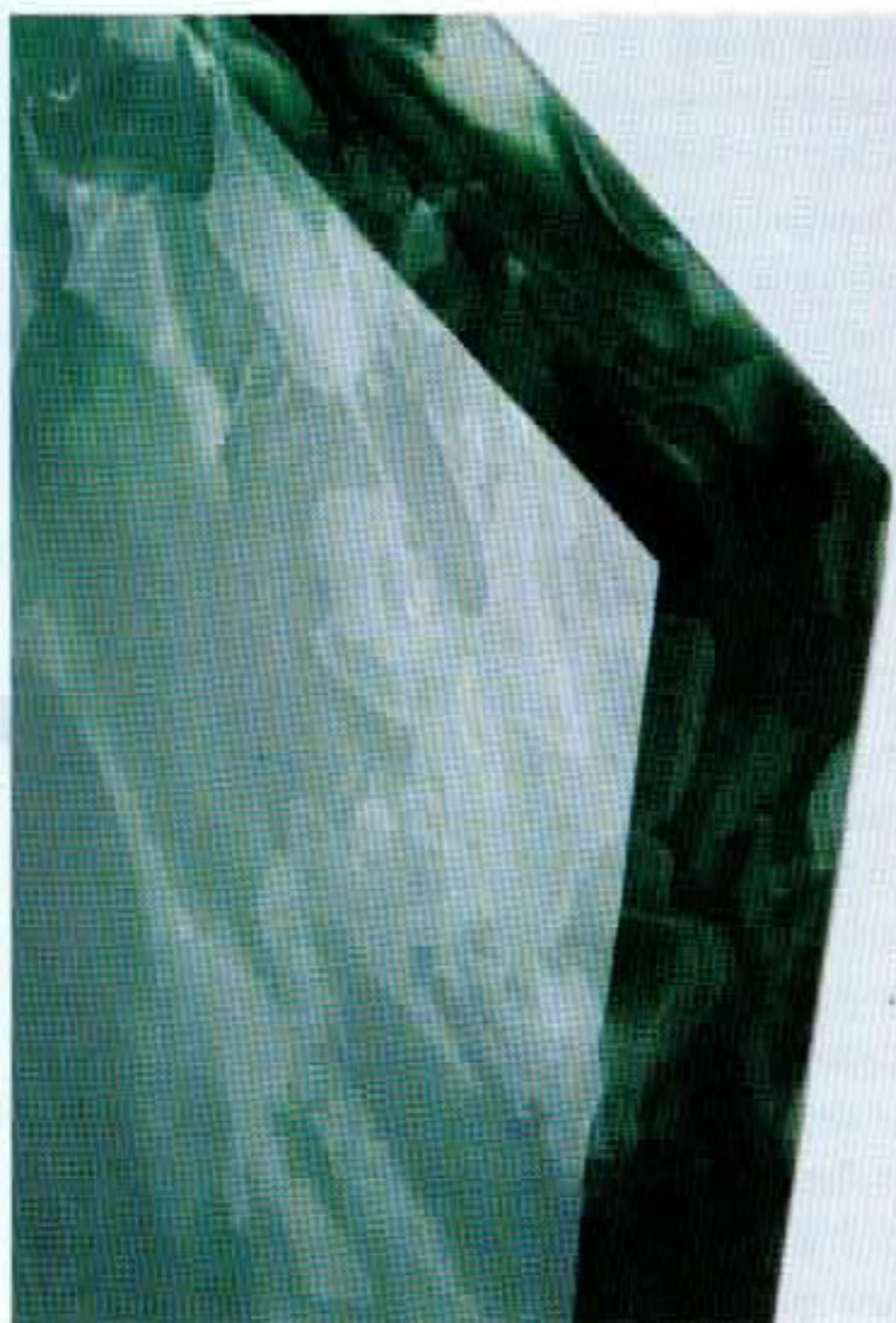
Malachite structure made of recycled glass