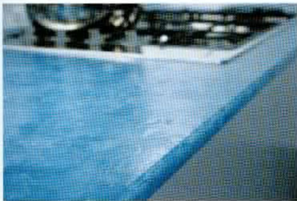
Recycled glass in use in the kitchen

This panel material is made of 100% recycled glass. Since it contains neither additives nor coloring agents, it can be recycled in its entirety. Only a small amount of energy is required for its production. Given its special aesthetic appeal and sealed finishes, Bio Glass® is used for worktops, furniture coating, and in interior design.