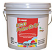
3 MAPEI ECO PRIM GRIP