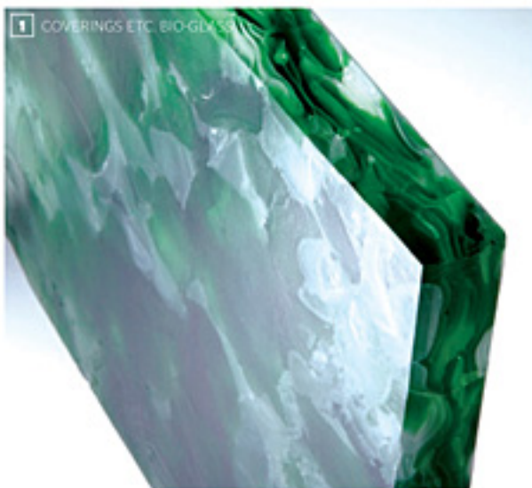
1 COVERINGS ETC. BIO-GLASS