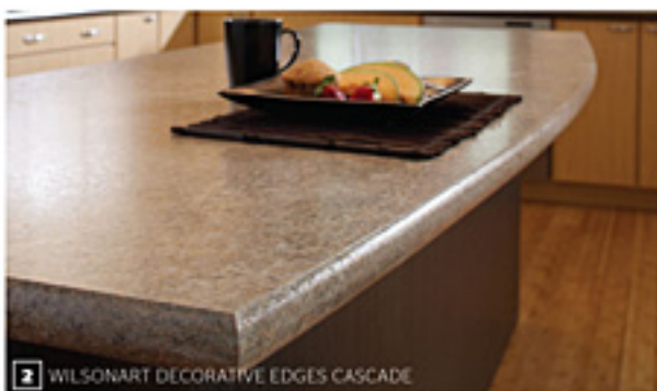
2 WILSONART DECORATIVE EDGES CASCADE